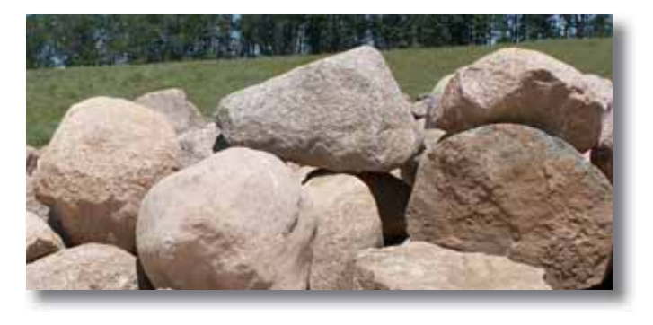
Note: Due to the nature of aggregate and variables within photography, colors shown may vary from overall hues. Please refer to actual products for final color selection.

The average weight of the smallest size boulders is approximately 2,500 lbs per piece.